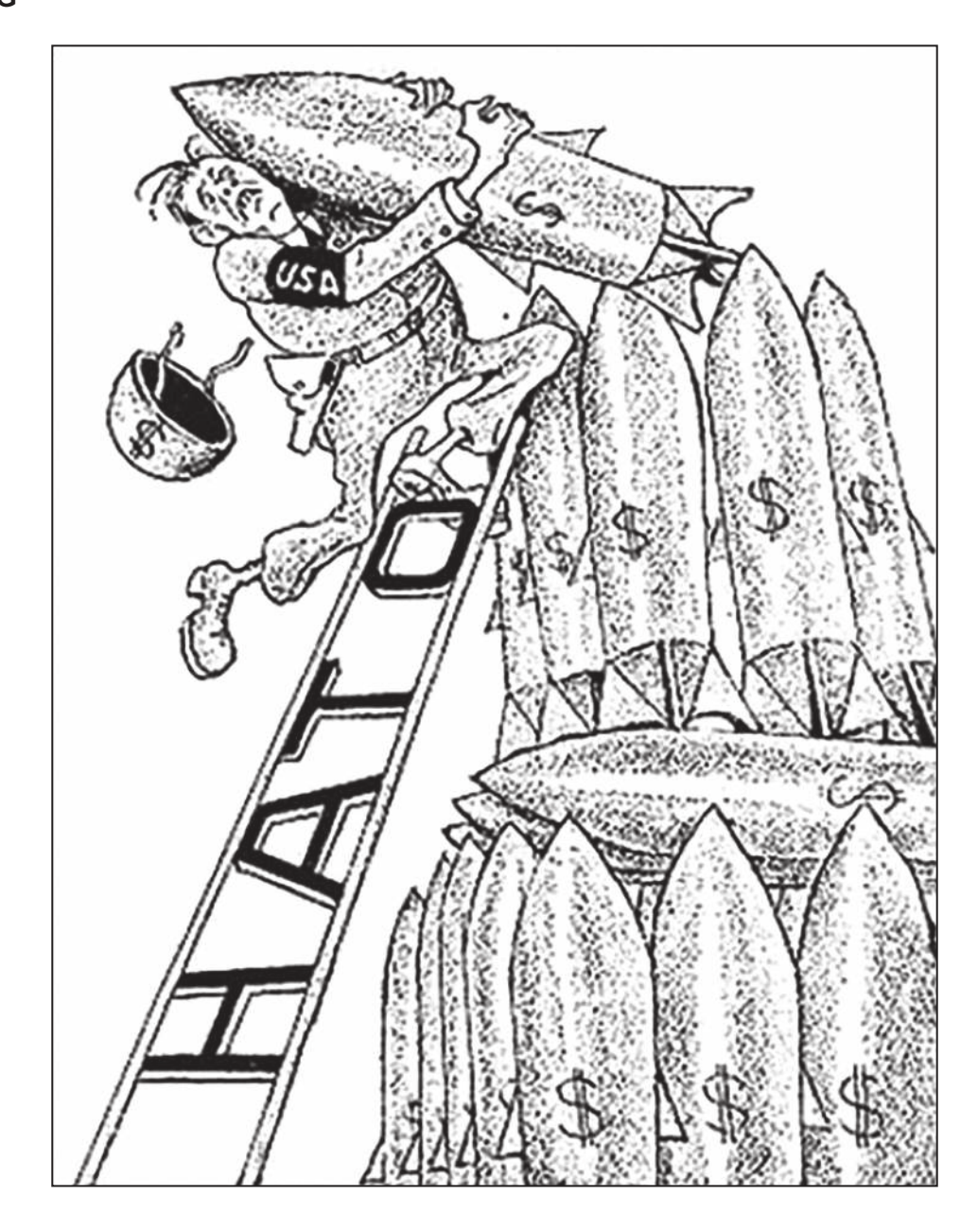
A cartoon published in the Soviet Union in 1949. The word on the ladder is 'NATO'.