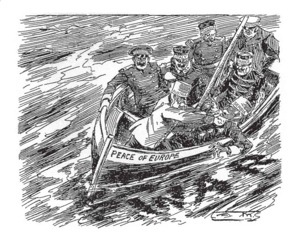
A cartoon published in Britain, 1 August 1914.