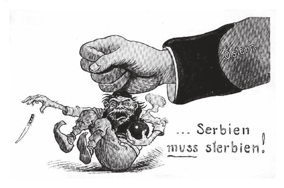
An Austrian cartoon published shortly after the assassination of Archduke Ferdinand. The words say 'Serbia must die!' 'Osterr' means Austria.